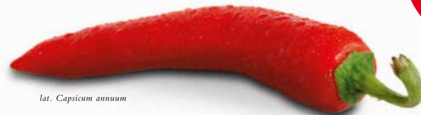
lat. Capsicum annuum